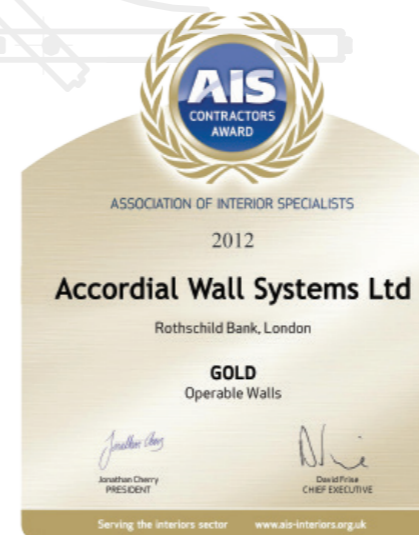
Accordial win Association of Interior Specialists GOLD Award for Movable Wall Category for the installation at Rothschild Bank